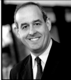
DAVID HANSON MP

Write to me: 64 Chester Street, Flint, Flintshire CH6 5DH