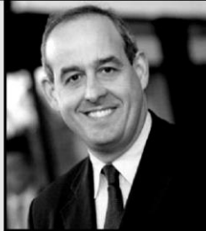
DAVID HANSON MP

Write to me: 64 Chester Street, Flint, Flintshire CH6 5DH OR House of Commons London, SW1A 0A