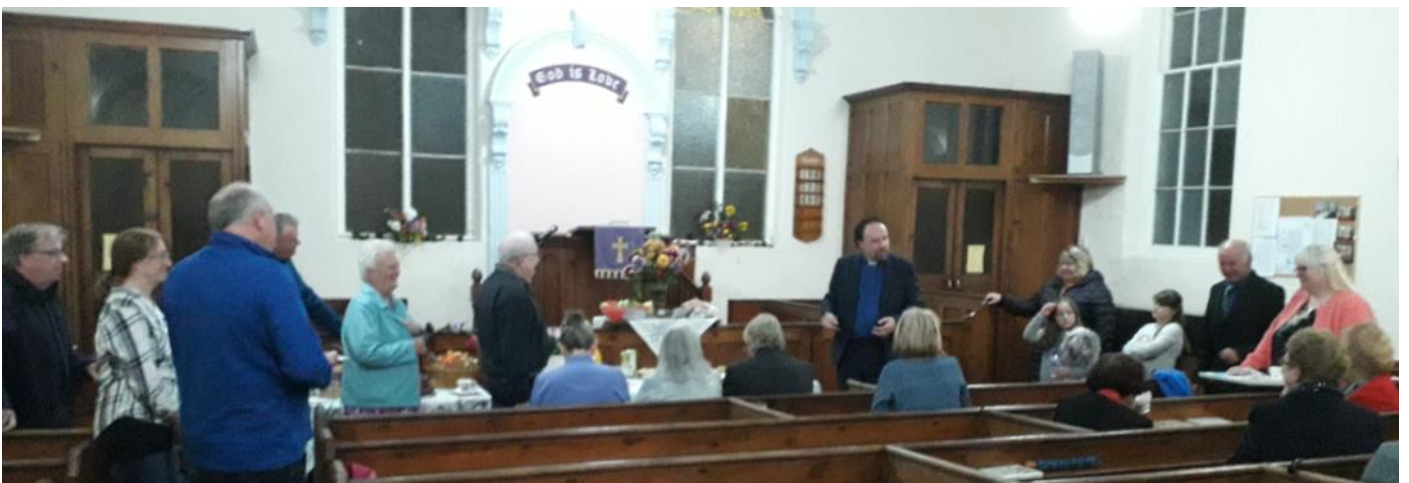
Refreshments and a convivial chat