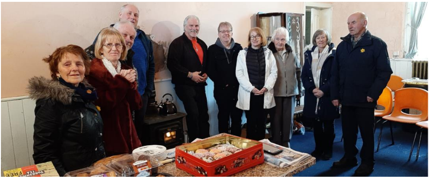
Enjoying the renovated kitchen