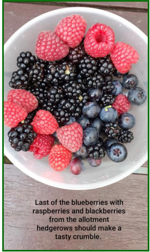
Last of the blueberries with raspberries and blackberries from the allotment hedgerows should make a tasty crumble.